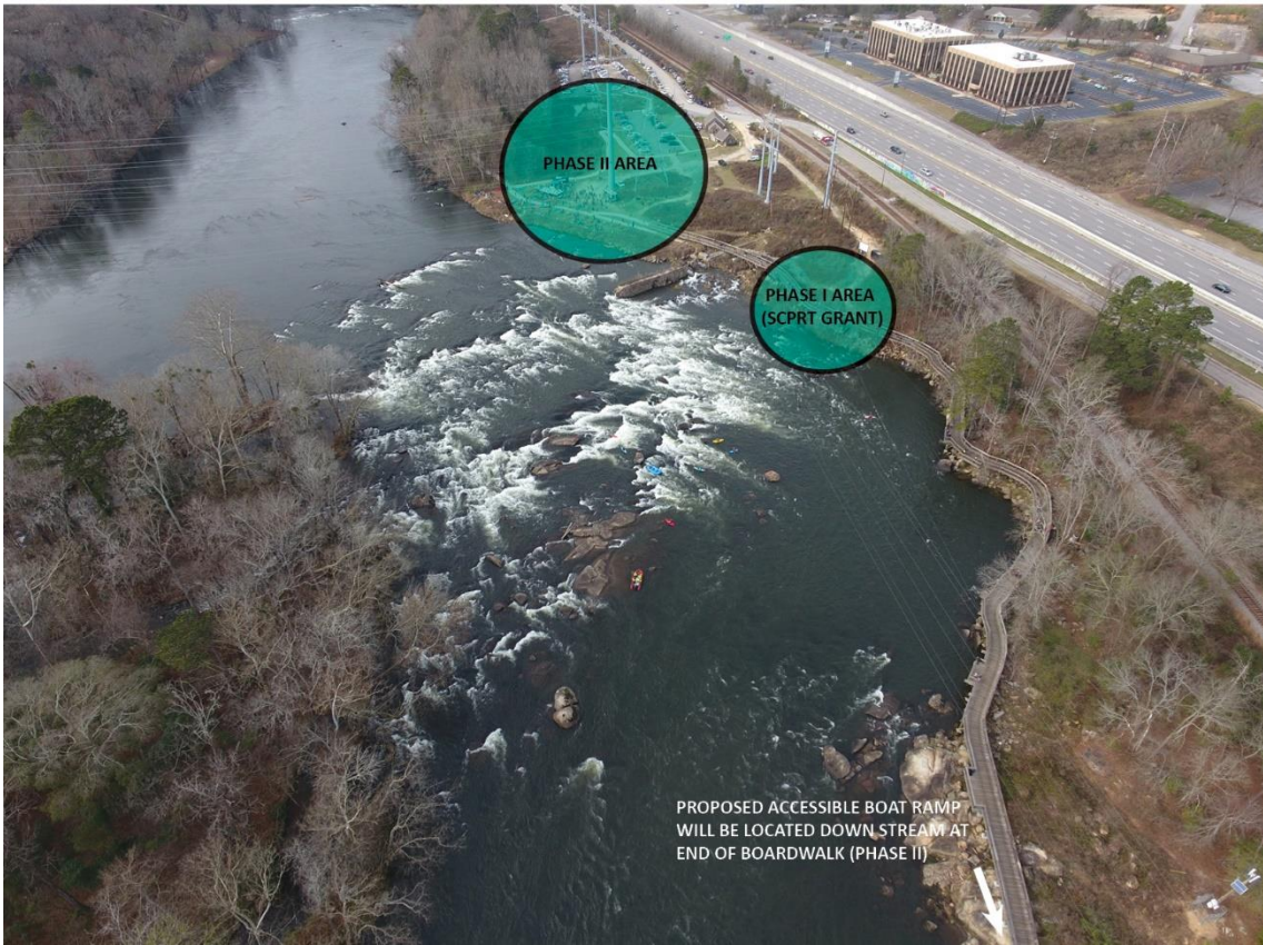
Figure 2: Saluda river imagery with current project zones