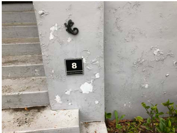
Areas of repair/maintenance