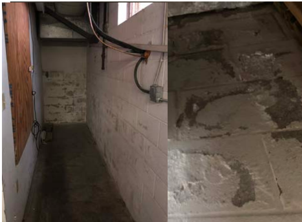
Some examples of water infiltration in basement