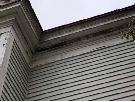
Areas to be repaired/painted